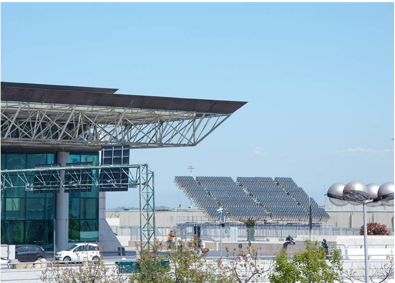
SMART GRID - PHOTOVOLTAIC SYSTEM

The integrated system of certifications that ADR implements is an important tool for supporting ongoing improvement of quality and the management of environmental issues. The structure of the management